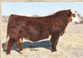
Churchill Red Baron 8300F