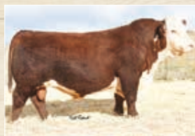
TH 409A 475Z Due North 361C ET