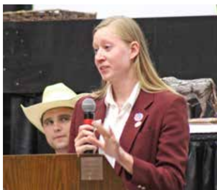
Montana's retiring address.