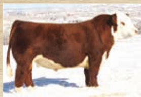
Churchill Kickstart 501C