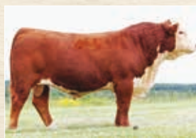
Behm 100W Cuda 504C