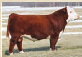
AH JDH Munson 15E ET