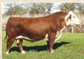
Mohican THM Excede Z426