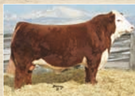
KT Small Town Kid 5051