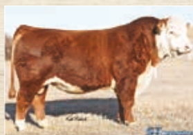
Innisfail WHR X651/723 4013 ET