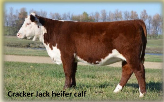
Cracker Jack heifer calf