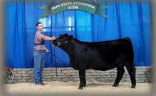
GLS Miss Trails End 156Z Purebred Division Champion Heifer

Heading to the Go-Pher 2013 with this pair of females! 808 is safe in calf to 719T, bred on 4/22. 303A is an About Time granddaughter ready to show and make a great cow!