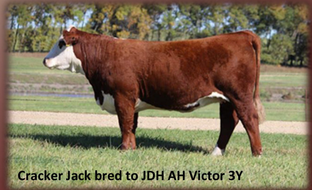
Cracker Jack bred to JDH AH Victor 3Y