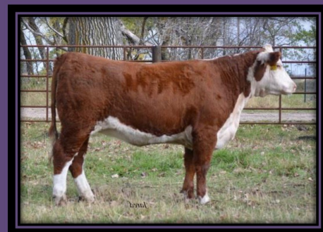
Ms Dakitch MDK Mack Liz 71Z

Right to Flush selling in the Elite sale at Gopher