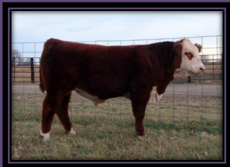
Dakitch 35Y National Trust

AI bred to TH 89T 755T Stockman 475Z due 3-2-14