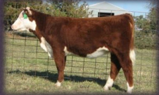
JMF Miss Fancy 303A P43398235 Lot 8A

JMF Herefords and SimAngus ...a program with a future.