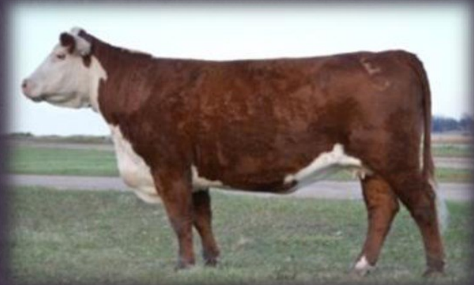
TTFL Beatrice Tank 808 P42944219 Lot 8

Heading to the Go-Pher 2013 with this pair of females! 808 is safe in calf to 719T, bred on 4/22. 303A is an About Time granddaughter ready to show and make a great cow!