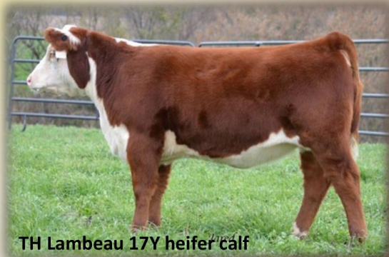
TH Lambeau 17Y heifer calf