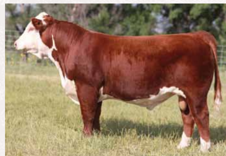
HH Perfect Timing 0150 ET Sire of 3114

CL 1 DOMINO 955W H W4 RW ELLA 1201 ET GO MS L18 EXCEL P83