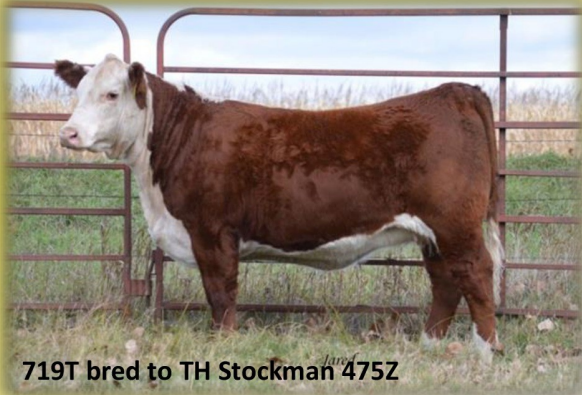
719T bred to TH Stockman 475Z