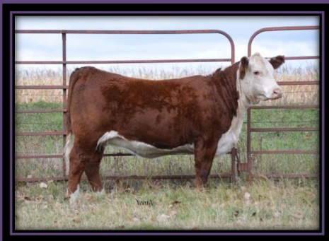
Ms Dakitch 45X Polly 112Z

AI bred to TH 89T Stockman 475Z due 3-2-14