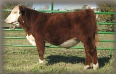
JMF Time Tank 306A Purchased by Carlson Farms Murdock MN