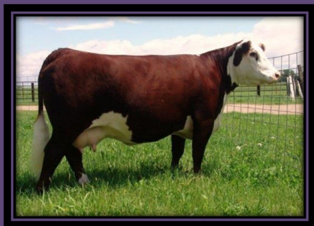
Ms Dakitch MDK Pearl 37W

Visit www.dakitchfarms.com for more details!