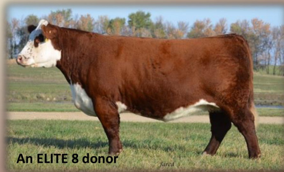
An ELITE 8 donor