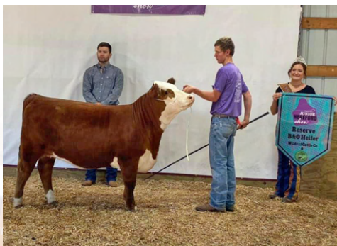
Reserve Champion B&O heifer