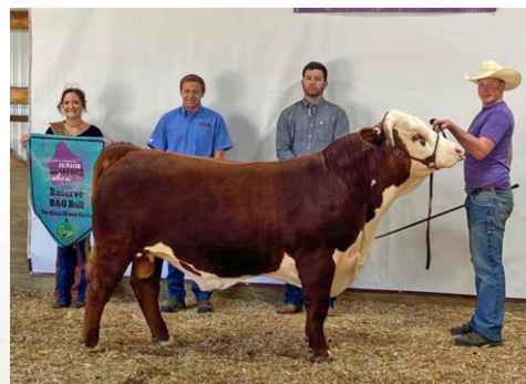
Reserve Champion B&O bull