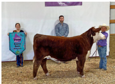
Reserve Champion owned heifer