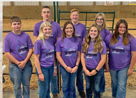
New Minnesota Junior Hereford Breeders board members