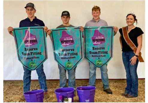
Reserve Champion team for team fitting competition