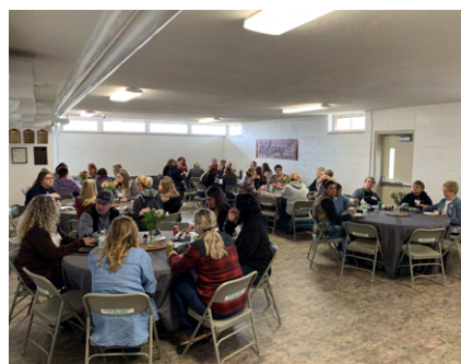
Attendees enjoying lunch provided by Three Rivers Cattlemen.