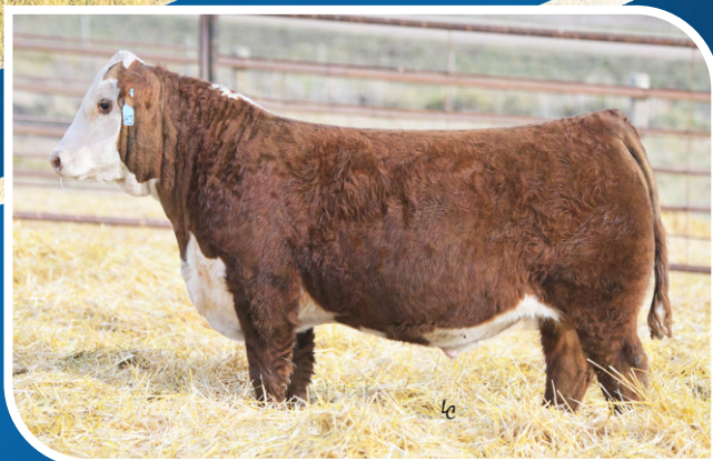
TH 195B EXECUTIVE 134J

A.I. Service Sire. Top selling heifer bull prospect at Topp Herefords Bull Sale.