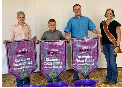
Champion team for team fitting competition