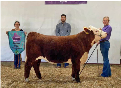
Reserve Champion steer