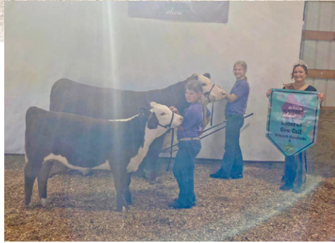
Reserve Champion cow/ calf pair