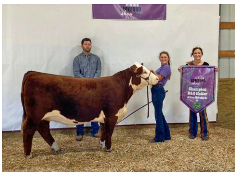
Champion B&O heifer