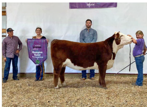
Champion owned heifer