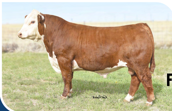
EL DORADO 57D - Sire of 6H

TH Big Country 537G • Boyd 31Z Blueprint 6153 Haroldsons Upgrade T100 33D • TH Frontier 174E TH Master Plan 183F • UPS Endure 8010