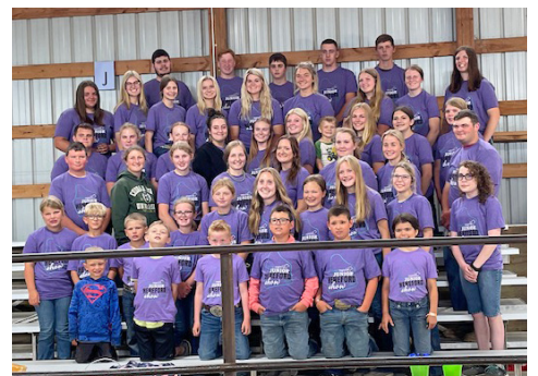
All the Juniors who participated at the show