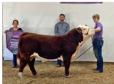
Champion B&O bull