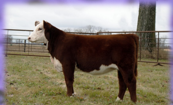
February 2018 ~ Cruiser x Trump 206Z