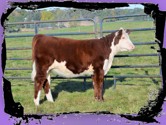
Heifer Calf Sired by CRR About Time

Selling over 55 lots including Herd Bull Prospects • Heifer Calves • Bred Heifers • Bred Cows