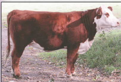
KPH 167Y TRUDY 1704