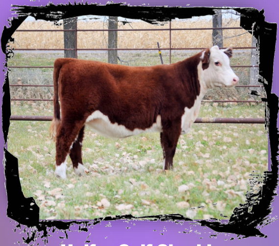
Heifer Calf Sired by TH 400U 32X Trump 206Z