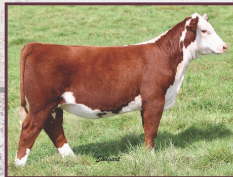
3/2/18 - 43917769 - Polled Wildcat x Milsap Class winner 2018 MN State Fair