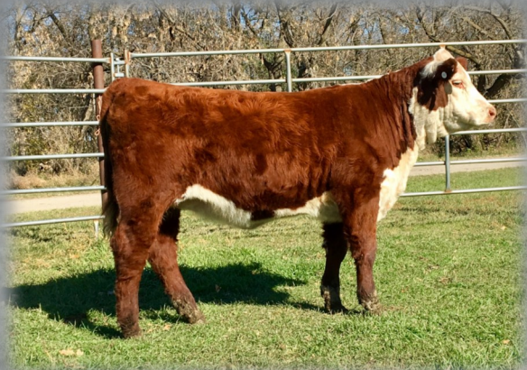
KCC Ms Ramona 8F ~ March 13, 2018 Sired by: TH 400U 32X Trump 206Z

Selling 3 Elite heifer calves at NorthStar Classic Hereford Sale December 1st!