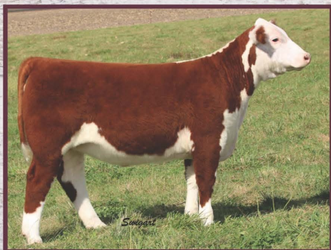
3/10/18 - 43929120 - Polled 19D x Vixen Donor