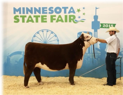
Champion Heifer Donnelly Farms