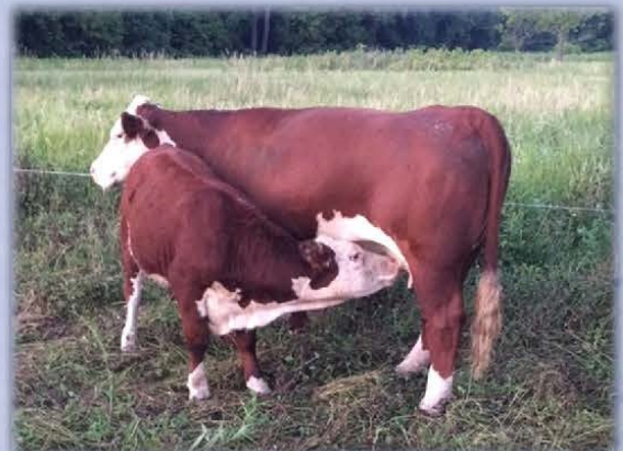
This January heifer calf sells! Mother is flush mate to JDH Victor 33Z!