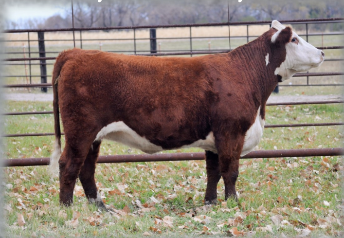
KCC Ms Valentine 11E Sired by: TH 400U 32X Trump 206Z Bred to JDH 114B Victor 33Z 78E

Bred Heifer selling Dec. 8th at the MN Gopher the Purple Sale