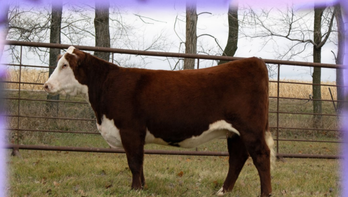
Crossroads x Tundra 62T Bred to CRR 109 Catapult 322