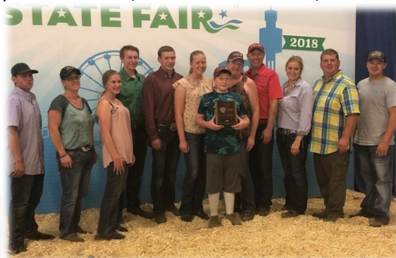
Premier Exhibitor Group Left to Right: TL Herefords, Lawrence Hereford, DaKitch Farms

Premier Exhibitor (3-way tie) – TL Herefords, Lawrence Herefords, DaKitch Farms