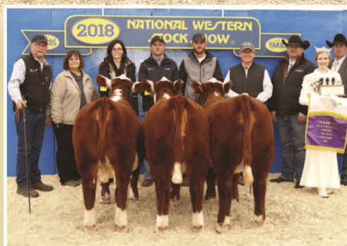
2018 NWSS CHAMPION PEN OF HEIFERS