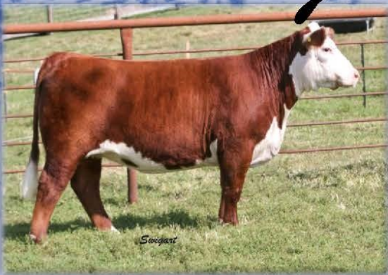
Her fancy February daughter by Red Bull Sells!