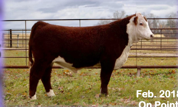
Feb. 2018 ~ Bull Calf On Point x Raftsman