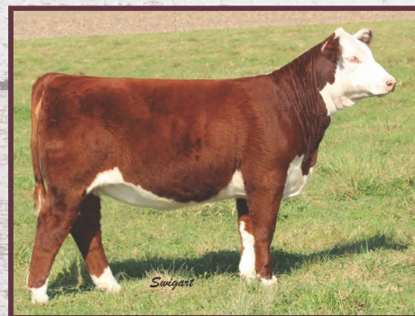
1/24/18 - 43929735 - Horned Wildcat x Fancy Donor