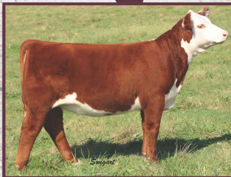
3/3/18 - 43929744 - Horned Wildcat x Fancy Donor