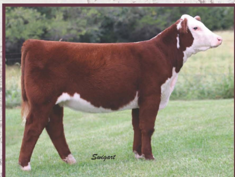
4/3/18 - 43916997 - Polled Commitment x Tuff