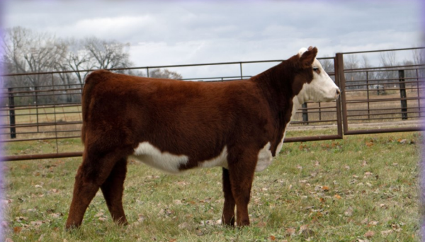
March 2018 ~ Cruiser x Trump 206Z

View more information at www.dakitchfarms.com