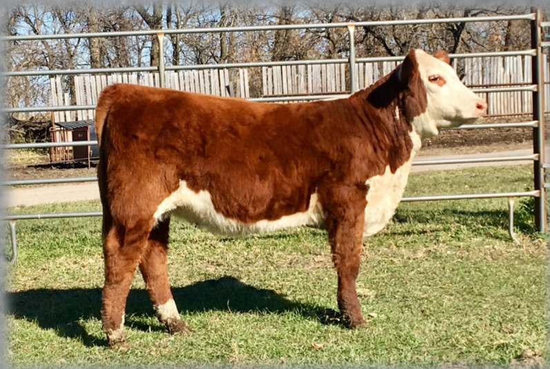
KCC Ms Bethenny 12F ~ March 20, 2018 Sired by: TH 400U 32X Trump 206Z