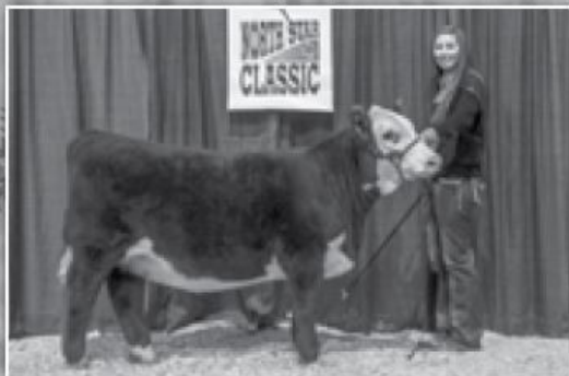
Sold in the 2017 North Star Classic Hereford sale Heifers of this quality will sell Dec. 1, 2018

Selling: 20 fancy heifers calves and select set of bred heifers Catalog will be available mid-November on www.northdakotaherefords.com