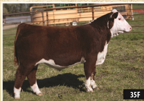
SEE HIM IN THE YARDS DENVER!!