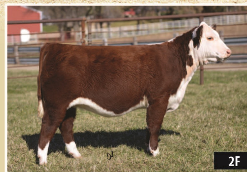
SEE HER IN THE YARDS DENVER!!

Join us for our 9th Annual Sale in January featuring our 2019 National Western Stock Show Carload and registered & commercial bred females. Watch for our catalog and videos to be available in early January.