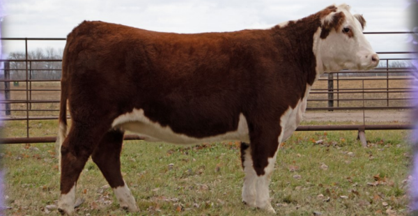
Crossroads x Traveler Bred to Worrell Ribeye 79C4