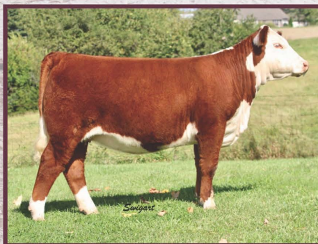
2/7/18 - 43929892 - Polled Catapult x Stacie Donor Class winner 2018 World Beef Expo