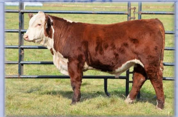
Reed Rio R874 - March Herd Sire Prospect! H FHF Advance 524 ET x Cash Flow