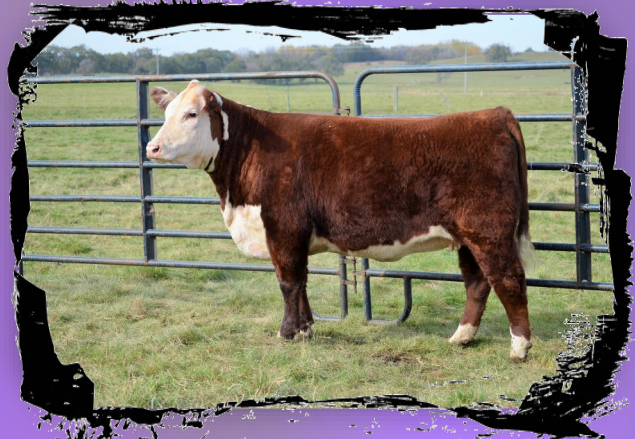
GV CMR 351 Proof Y459 daughter Bred to KT Built Tuff