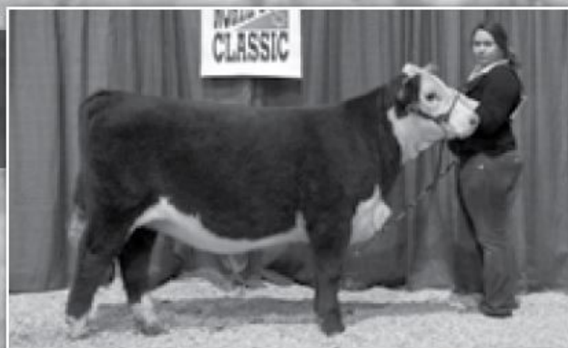
Sold in the 2017 North Star Classic Hereford sale Heifers of this quality will sell Dec. 1, 2018