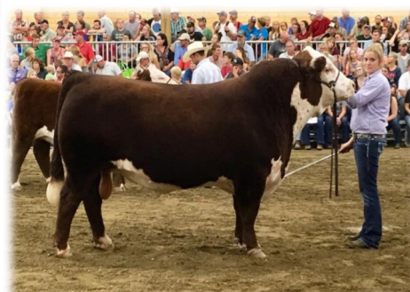
Champion Bull DaKitch Farms