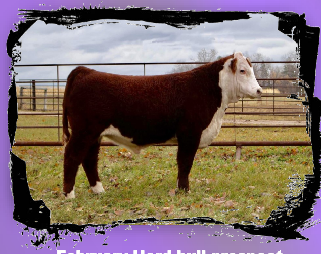
February Herd bull prospect Sired by CRR On Point