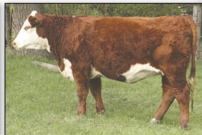
KPH 10Y HOMEGIRL 1740

NJW Trust 167Y daughter out of a Ribeye R117 cow. Low birth, high carcass, full pigment. Bred to SHF W18 Chlorine C90, our easy calving Wonder son from Sandhill Farms on May 30. DNA profiled. BW 2.4 WW 54 YW 92 M 28 M&G 55 REA .56 Marb .37 CHB$ 119