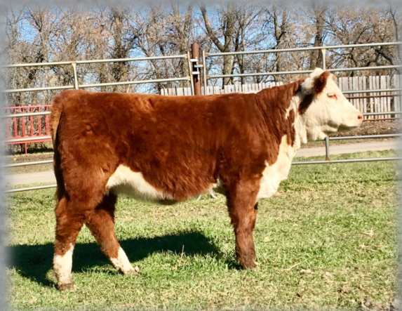
KCC Ms Kate 2F ~ March 9, 2018 Sired by: CRR 109 Catapult 322

Bred Heifer selling Dec. 8th at the MN Gopher the Purple Sale