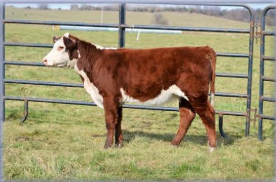
Reed Angel R883 This May show heifer prospect sells!