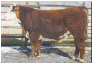
KPH 201E LOUIS 2066 P44132727 • 2-29-20 BW WT. 83, 205 WT. 690 • HOMO POLLED SIRE HARVIE E SACKETT ET 201E CE 4.9, BW 4.6, WW 67, YW 106, SC 1.4, MILK 36, REA .28, IMF .01