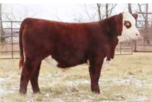
High Selling Bull: Lot 3 - Consignor: Sip Stock Farm $3650 - Buyer: Colby Kaup - Hoven, SD