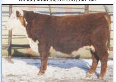
KPH 10Y HOMEBOY 2031 P44132543 • 2-19-20 BW WT. 79, 205 WT. 698 • MDF HETERO POLLED SIRE HOMETOWN 10Y CE 7.1, BW 2.8, WW 59, YW 101,