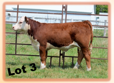
Reg. # 43920982 Sire: NJW 73S M326 Trust 100W