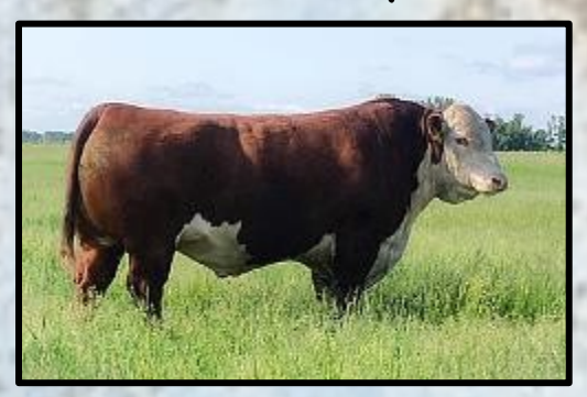
DPH 6129 Take Off 502 ET Sire: CRR 719 Catapult 109