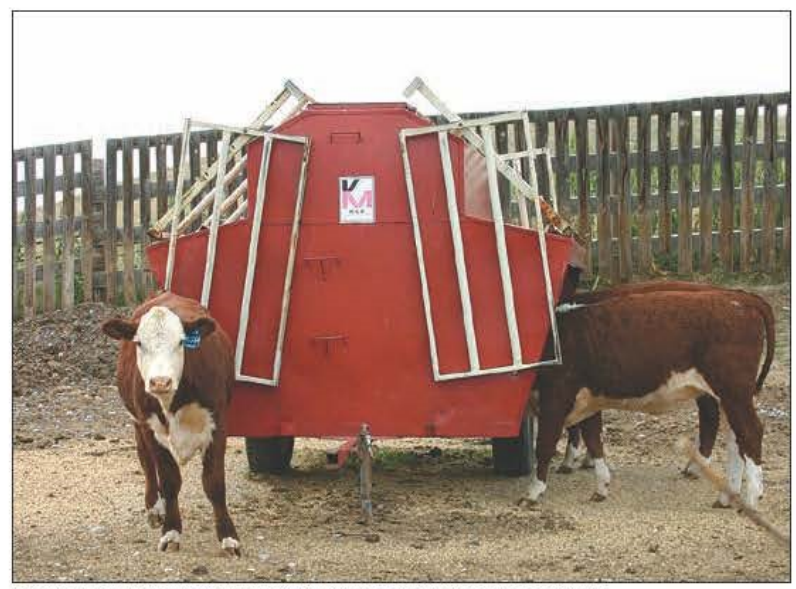
Maximize creep feeding potential by considering location, number of head and consumption

Paying attention to a few do's and don'ts can help offset the extra cost of creep feeding. Elkins suggests preparing for next summer's creep feeding season with these tips: