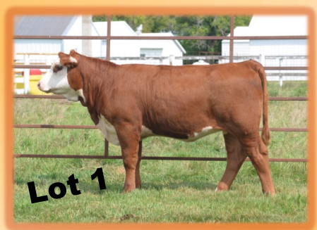
Reg. # 43938770 Sire: WLB Yukon 50D

Saturday Sept. 8, 2018 — Bid off at 5 p.m. (CDT) — Leonard, N.D Selling 10 elite heifer calves ~ 5 Bred Heifers ~ select group of young bred cows