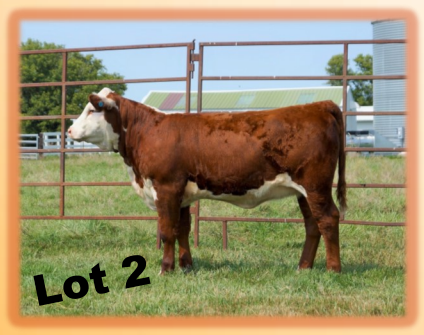
Reg. # 43939136 Sire: TH 143X 17Y Lambeau 102A