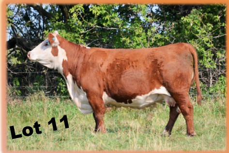
WCC 72R 26U Kalle 30Z

Reg. # 43856708 Selling Right to flush plus embryo package sired by TH Frontier 174E