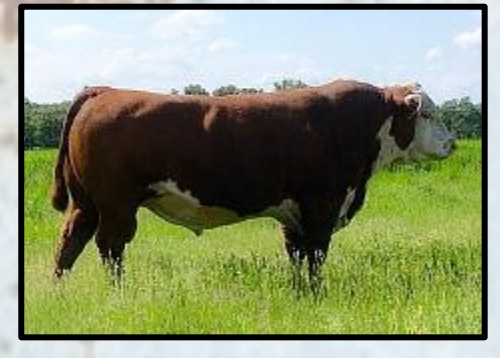
CRR 322 Catapult 697 Sire: CRR 109 Catapult 322

Consigning to the 2018 Gopher Sale & 2019 Sioux Empire Livestock Show