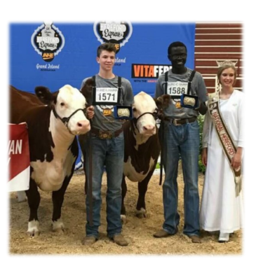
Tar Tut was selected as Reserve Champion Intermediate Showman