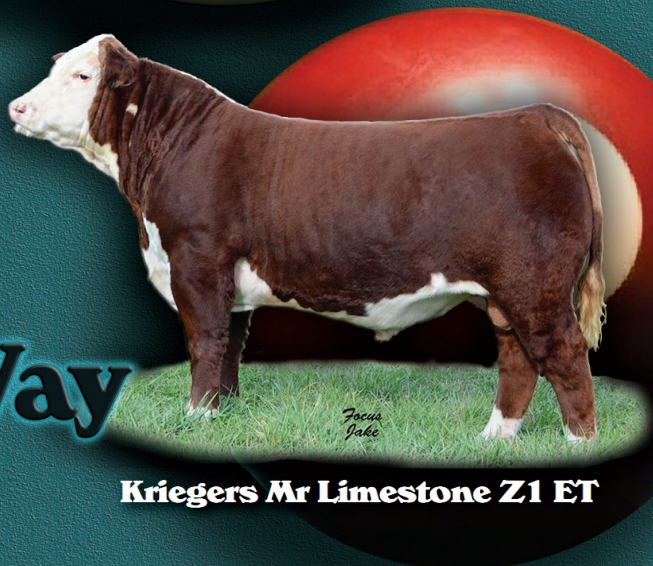
Kriegers Mr Limestone Z1 ET