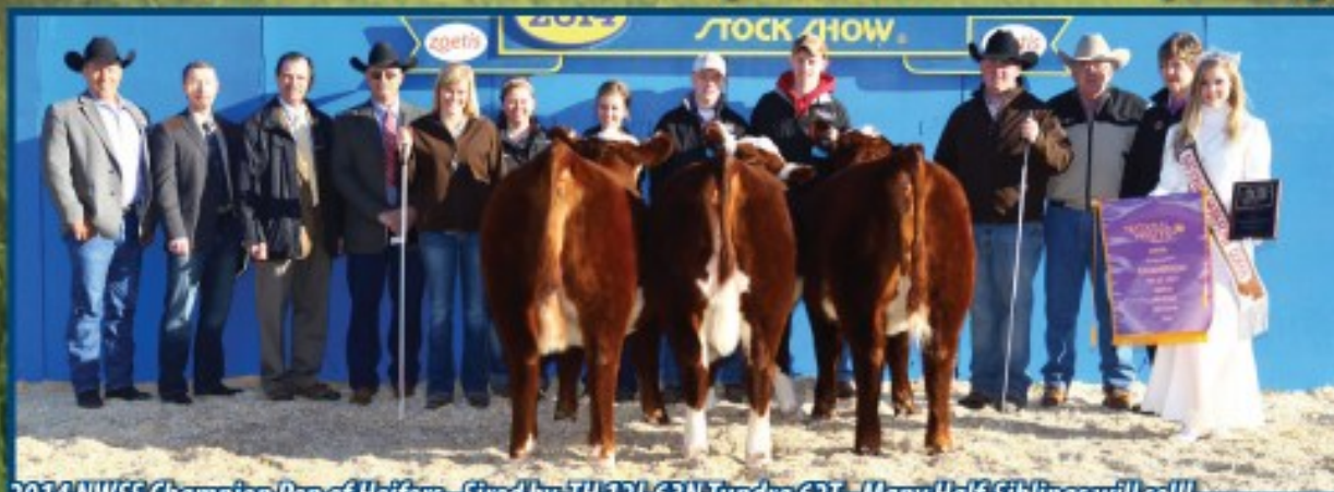
2014 NWSS Champion Pen of Heifers - Sired by TH 12L 63N Tundra 62T - Many Half-Siblings will sell!

Both embryos and semen on this up and coming sire will sell!