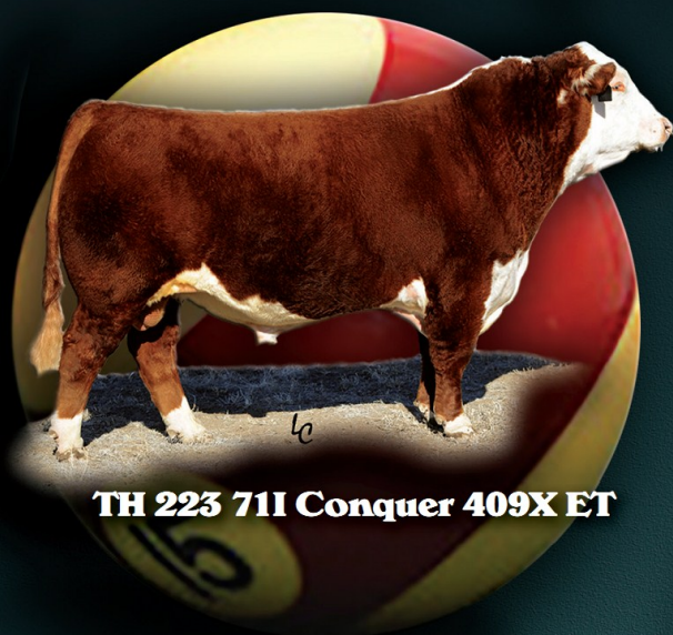
TH 223 71I Conquer 409X ET