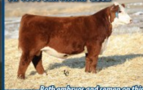
TH 400U 32X TRUMP 206Z

Both embryos and semen on this up and coming sire will sell!