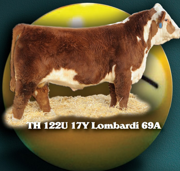
TH 122U 17Y Lombardi 69A