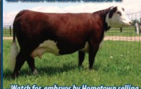
MS DAKITCH MDK PEARL 37W

Watch for embryos by Hometown selling on September 20-21!