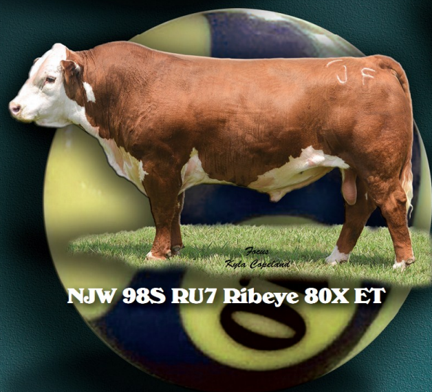
NJW 98S RU7 Ribeye 80X ET