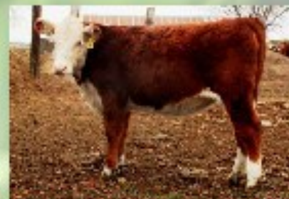
Tank 65X Daughter