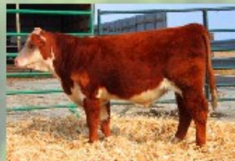
SH Unity Son