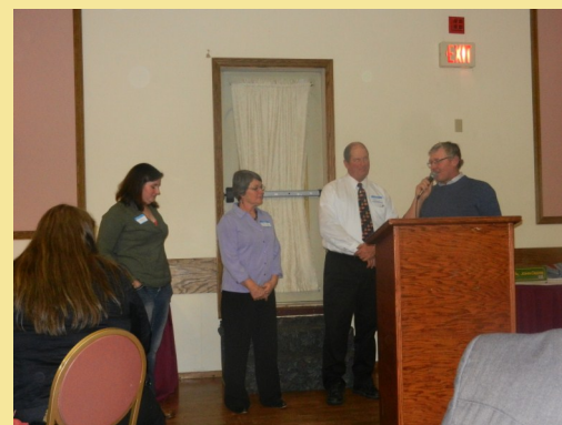
Jim and Jeri Hanson Family Enthusiast of the Year Award