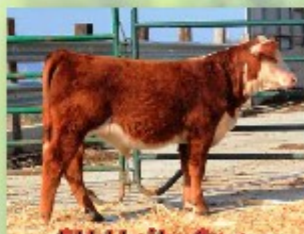
SH Unity Son