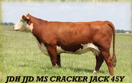
JDH JJD MS CRACKER JACK 45Y