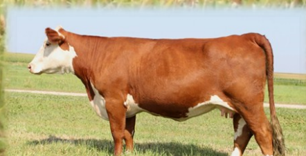
WCC 41W 1P MISS TANK 09Y