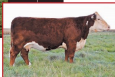
DAM OF 7B

*Very feminine, attractive daughter of Victor 755T. Sleek fronted and lots of rib shape; an outstanding cow prospect!