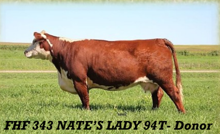
FHF 343 NATE'S LADY 94T- Donor