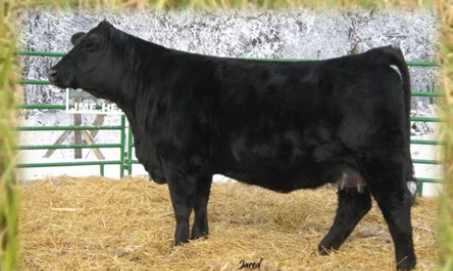
GLS MISS PACE Y145