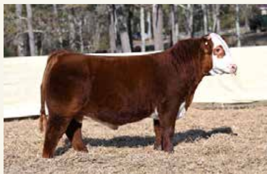
DCF DBF 2138 CUDA BELL 17N ET (44669948)