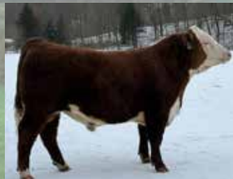
JMP RJ WINNER S15M; BD 10/10/24; REG NO. P44606848; HOMO POLLED