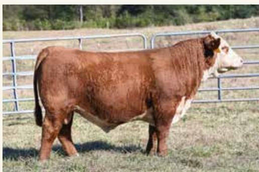
DCF LBB J51 FIRST CLASS 143L (P44564394)

HOMO POLLED HIGH SELLING BULL AT 2025 NATIONAL WESTERN OWNED WITH OLD FASHIONED GROUP