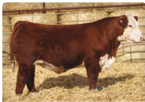
34 SLEEPY BT FINAL PRINT 5300 RST FINAL PRINT 0016 | 44661265

Featuring the best of our Angus, Hereford, and Simmental genetics.