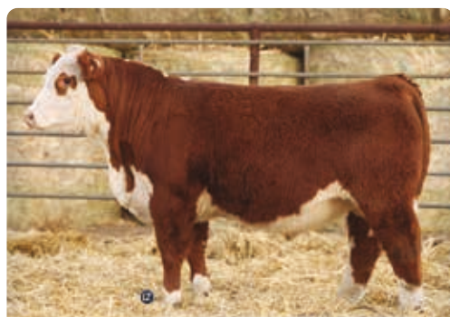
39 SLEEPY FREEDOM 540 PCC 5102 173D FREEDOM 0307 ET | 44723761