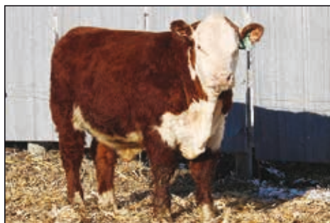
KPH 1901F MARS 2534