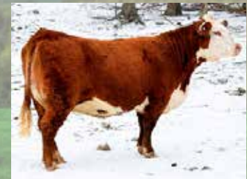
JMP RJ HEARTLAND N15L; BD 9/5/23; REG NO. P44510676, BRED DUE MID-FEB