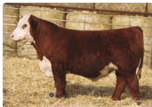
36 SLEEPY BT FINAL PRINT 5951 RST FINAL PRINT 0016 | 44661502