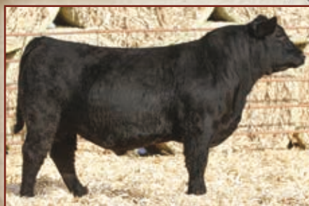
BEVER JUSTIFICATION 445 PB ANGUS 21498136 – BD: 8/24/24

Saturday MARCH 28, 2026 Sleepy Eye Auction Market