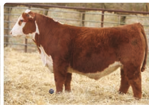
27 SLEEPY BT GENESIS 5615 ET LOEWEN GENESIS G16 ET | 44674954