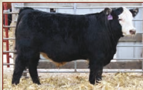
SAJ BAM BAM N09 1/2 SIMMENTAL 4604075 – BD: 3/2/25

CATTLE VIEWING 9AM-1PM 40+ BULLS AVAILABLE COMPLIMENTARY LUNCH ONLINE BID OFF AT 1PM RACE HORSE STYLE