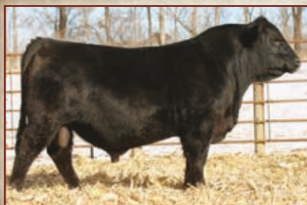
BEVER FAIR-N-SQUARE 448 PB ANGUS 21505115 – BD: 8/26/24

CATTLE VIEWING 9AM-1PM 40+ BULLS AVAILABLE COMPLIMENTARY LUNCH ONLINE BID OFF AT 1PM RACE HORSE STYLE