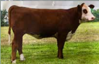
Macey M272 Reg. No. P44611900 BD: Sept. 29, 2024 Fall Bred

Wisconsin State Sale - March 21, 2026 - 12 P.M. Dutch Valley Auction Building, Platteville, WI