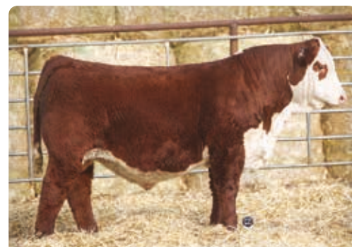
26 SLEEPY ENTICE 536 ET UPS ENTICE 9365 ET | 44720297