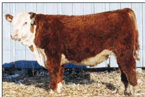
KPH 173K SOUL MAN 2508