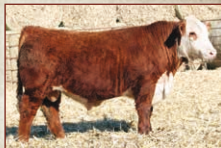
J&J 57H VALOR 5013 20N PB HEREFORD P44644001 – BD: 3/5/25