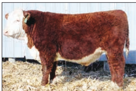
KPH 174E FRONTIERSMAN 2505

AVERAGE EPDS OF SALE BULLS: BW 2.1, WW 64, YW 101, SC 1.4 MILK 34, REA .51, IMF .09