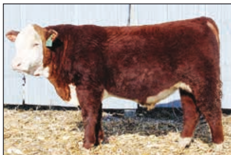
KPH 1359TH THOR 2529