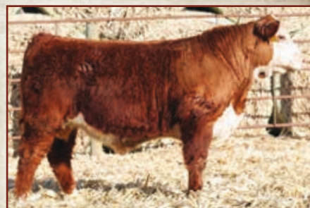
J&J 31J ENTICE 33J 11N PB HEREFORD P44638732 – BD: 2/21/25