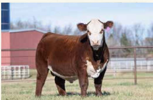
JDH AH OLD FASHIONED 25M ET (P44555393)

HOMO POLLED OWNED WITH WALKER POLLED HEREFORDS