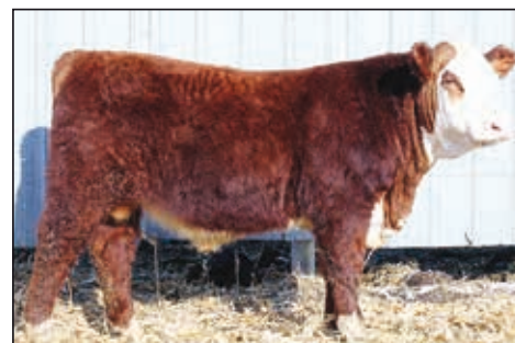
KPH B30 BREWSTER 2524