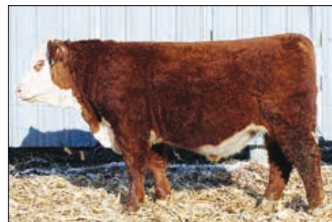
KPH 112D TAYLOR 2535