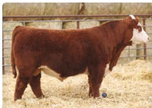
43 SLEEPY BT PERFECTO 5361 BG LCC 11B PERFECTO 84F | 44661311