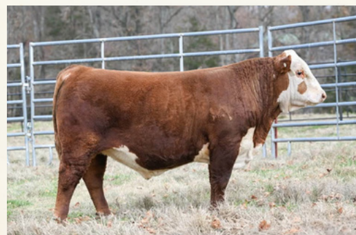
WLKR JH MAXIMUM 9244 3110L ET (P44534952)