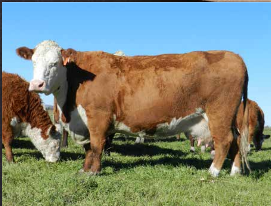
Dam LJS MS Domino 1439 Dam of Distinction Pictured at 7 1/2 years.