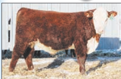
KPH 1901F MARS 2102 • 44245696 • 1/31/21 BW 88, ADJ WN WT 786 • HOMO POLLED SIRE: KPH 174E SNICKERS 1901 CE -0.1, BW 5.7, WW 84, YW 140, SC 1.9, MILK 33, REA .68, IMF -.03