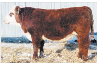
KPH 174E FRONTIERMAN 2132 • 44245706 • 2/21/21 BW 85, ADJ WN WT 769 • HOMO POLLED SIRE: TH FRONTIER 174E CE 3.7, BW 3.4, WW 75, YW 122, SC 1.5, MILK 39, REA .56, IMF .00