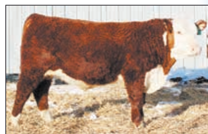
KPH 20X HARDCOPY 2119 • 44245578 • 2/12/21 BW 98, ADJ WN WT 756 • HOMO POLLED SIRE: MSU XEROX 20X CE 0.6, BW 3.6, WW 69, YW 108, SC 1.1, MILK 25, REA .56, IMF .06