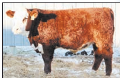
KPH D 10Y HOMERUN 103 • 44245498 • 2/7/21 BW 91, ADJ WN WT 786 • MDF SIRE: NJW 73S W18 HOMETOWN 10Y ET CE 4.0, BW 1.6, WW 53, YW 89, SC 0.9, MILK 27, REA .27, IMF .16