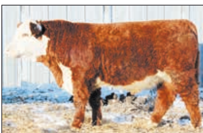
KPH B30 BREWSTER 2110 • 44245705 • 2/10/21 BW 69, ADJ WN WT 728 • HOMO POLLED SIRE: FRENZEN BAR JZ BRUISER B30 CE 7.8, BW 1.1, WW 67, YW 100, SC 1.4, MILK 35, REA .40, IMF .05