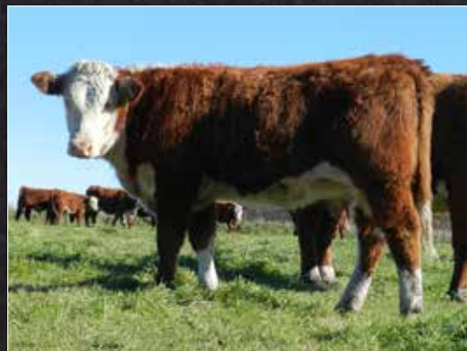
Daughter, LJS Ms Mark Domino 2116.