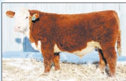
KPH 201E LOUIS 2124 • 44245509 • 2/14/21 BW 86, ADJ WN WT 668 SIRE: HARVIE E SACKETT ET 201E CE -1.5, BW 6.0, WW 69, YW 113, SC 1.1, MILK 33, REA .66, IMF .11