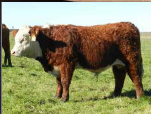
Son, LJS Mark Domino 2112. He will replace his sire.

CL 1 DOMINO 862U CL 1 DOMINO 0150X CL 1 DOMINETTE 8150U 1ET LJS MS DOMINO 1439 {DOD} LJS MARK DOMINO 0515 {SOD} LJS MS MARK DOMINO 0842 LJS MS MARK DOMINO 0204 {DOD}